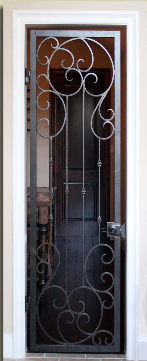
CHATEAU WINE ROOM GATE