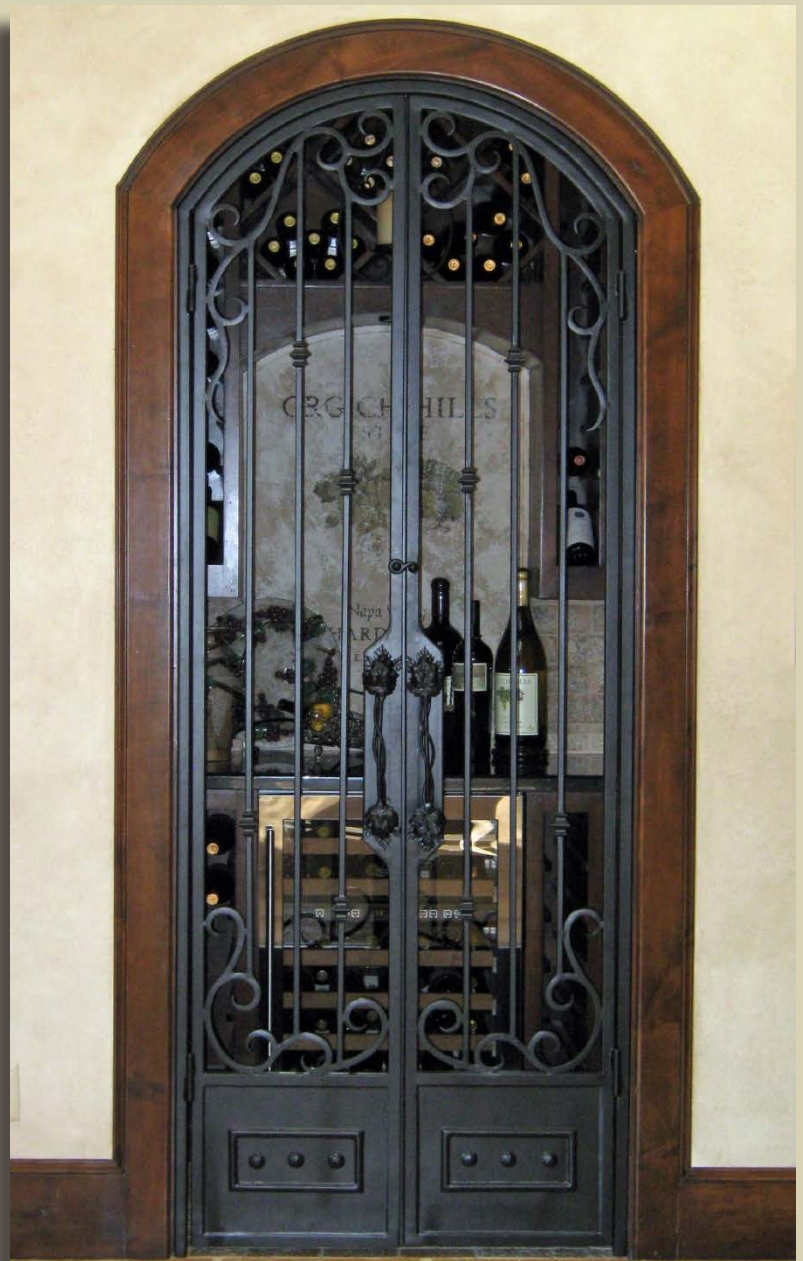
EDITH WINE ROOM GATE